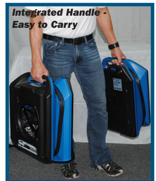
Integrated Handle - Easy to Carry