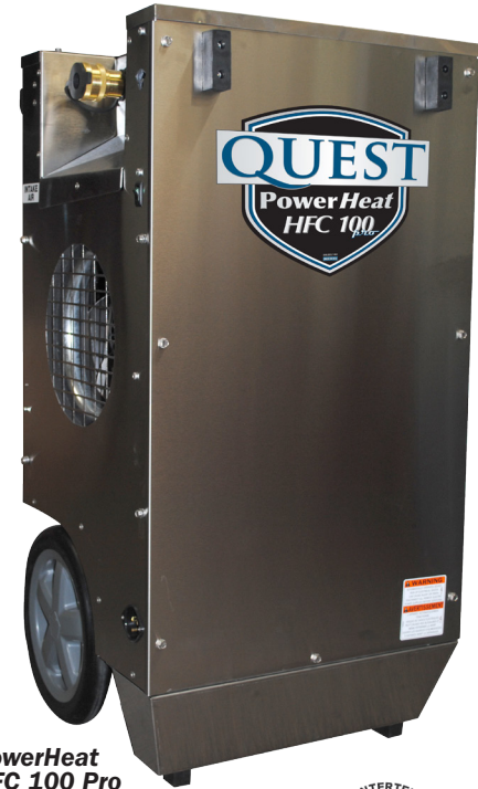
PowerHeat HFC 100 Pro